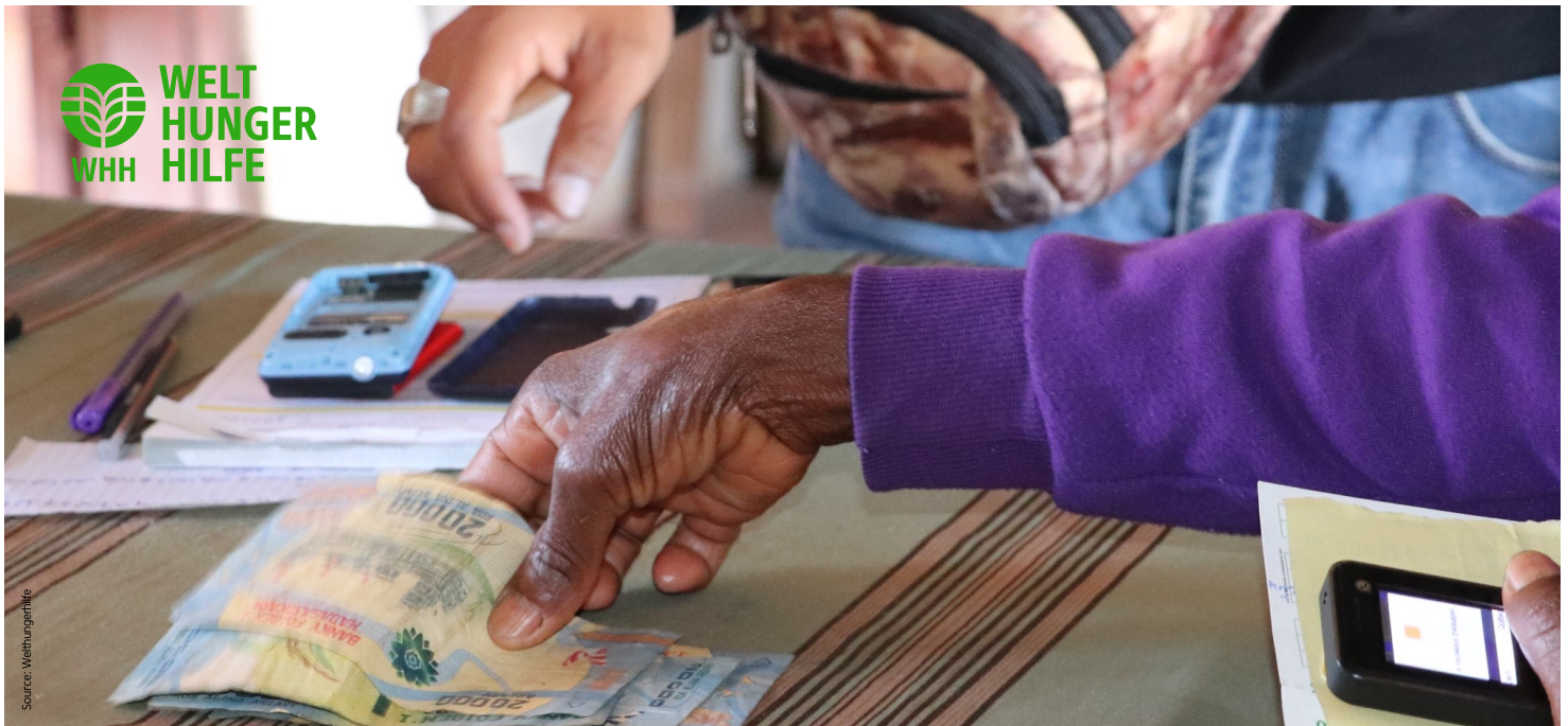
Cash distribution in Madagascar as part of a Welthungerhilfe project. Through this forecast based action the expected negative effects of climate change on the food security of the vulnerable population are being prevented.