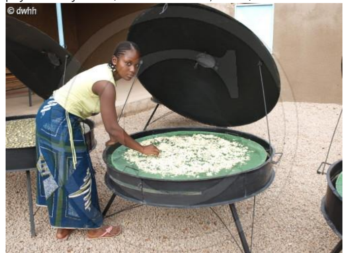
Picture 5: Drying of fruits and vegetables as processing technique. WHH project in Burkina Faso.

Premature harvesting, poor storage and lack of processing facilities contribute to high food and nutrient losses. Especially the conservation of perishable foods such as fruits and vegetables pose a challenge in this regard (FAO, 2010). Traditional processing methods can be improved to enhance the bioavailability of micronutrients in plant-based diets and to extend the shelf life. Methods include thermal and mechanical processing, soaking, fermentation and drying. Preservation techniques have the potential to increase the physiochemical accessibility of micronutrients and decrease the content of anti-nutrients or poisonous elements such as phytate or cyanide (Hotz and Gibson, 2007).