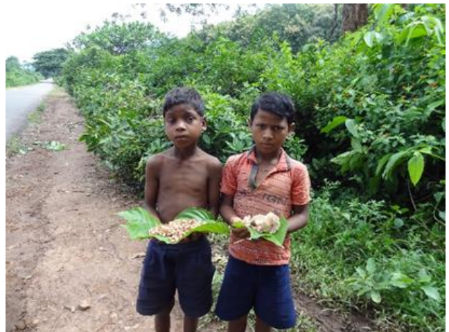
Picture 1: LANN in India (Odisha): Collecting foods from the forest.

LANN, “Linking Agriculture, Natural Resource Management and Nutrition”, is a community-based multi-sectorial training approach to improve family nutrition for remote areas. It focuses on improved agriculture, sustainable use of natural resources as well as improved family nutrition, including mother and child nutritional needs. The training approach integrates a lot of participatory “action learning” such as theatre, role plays, joint cooking classes and recipe development. LANN was developed in 2009 together with other NGOs in Laos and has been applied in WHH projects in Asia (Laos, Cambodia, Myanmar, Sri Lanka, India); since 2013 Sierra Leone has adopted LANN. Regarding the impact of LANN, “diet diversity” has in many cases improved which is associated with improved dietary adequacy.