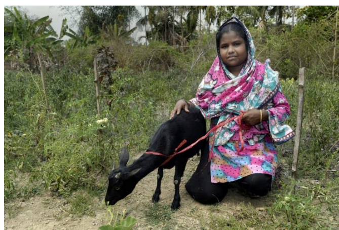
Picture 3: Integration of crops and livestock. WHH project in Bangladesh.

In an integrated system, crops and livestock interact to create a synergy, with recycling allowing the maximum use of available resources. Crop residues can be used for animal feed while livestock and livestock by-product production can enhance agricultural productivity by intensifying nutrients that improve soil fertility, reducing the use of chemical fertilizers (FAO, 2001). Animal source foods are an important source of high-quality protein and micronutrients. Aquaculture traditionally exists in many parts of Asia (e.g. in integrated systems for rice). Farmers need knowledge, assets and inputs to manage this integrated system in a sustainable way (FAO, 2001). Attention should be paid to possible negative effects of animal production on environmental degradation and climate change.