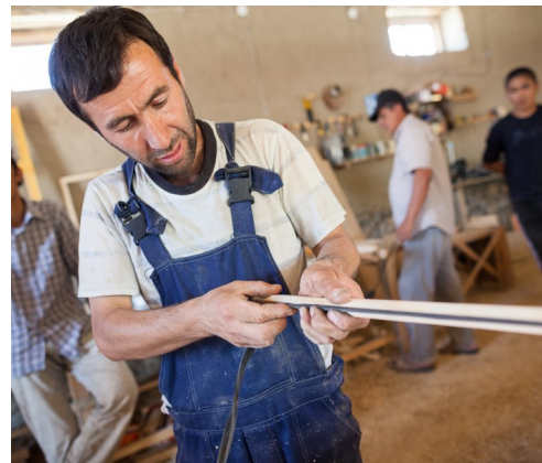
Picture 2: Locally produced Double-glazed window in the Zarafshan valley.